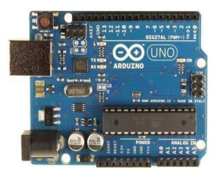
Fig 2: Arduino Uno

B. Zigbee : Zigbee is a wireless technology developed as an open global standard to address the unique needs of low-cost, low-power, wireless sensor networks. The standard takes full advantage of the IEEE 802.15.4 physical radio specification and operates in unlicensed bands worldwide at the following frequencies: 2.400–2.484 GHz, 902-928 MHz and 868.0–868.6MHz.