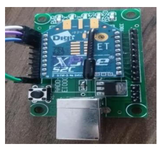
Fig 3: Zigbee

The Zigbee module acts as both transmitter and receiver. The RxandTxpinsofZIGBEEareconnectedtoTxandRxof8051 microcontroller respectively. The data's from microcontroller is serially transmitted to Zigbee module via UART port. Then Zigbee transmits the data to another Zigbee. The data's from Zigbee transmitted from Dout pin. The Zigbee from other side receives the data via Dinpin.