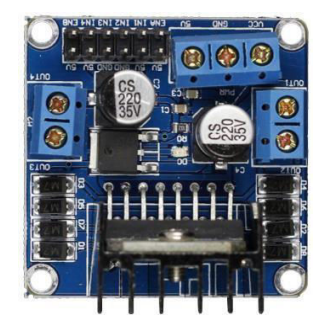
Fig 4: Motor drive