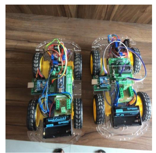
Fig 6: Master and Slave robot

In the above figure 6, we are seeing the two robots which one of the maremaster while the other acting as a slave. In the figure the robot which is following the other is called as a slave where the followed robot is called master. Master gave commands to the slave when it is started to the destination and the slave follows the commands to reach the destination.